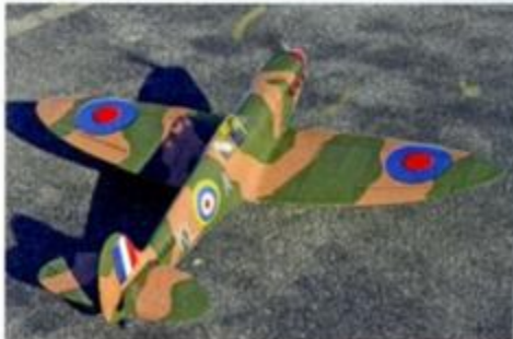
Gary Brown built his Spitfire Mk 1 from enlarged Model Builder plans. The RC conversion is electric powered with retractable landing gear from E-flite.

Next up in the realm of small-field models is the Dumas Ercoupe from Jeff Fozard. The kit was built basically stock but with the addition of a steerable nose wheel and a