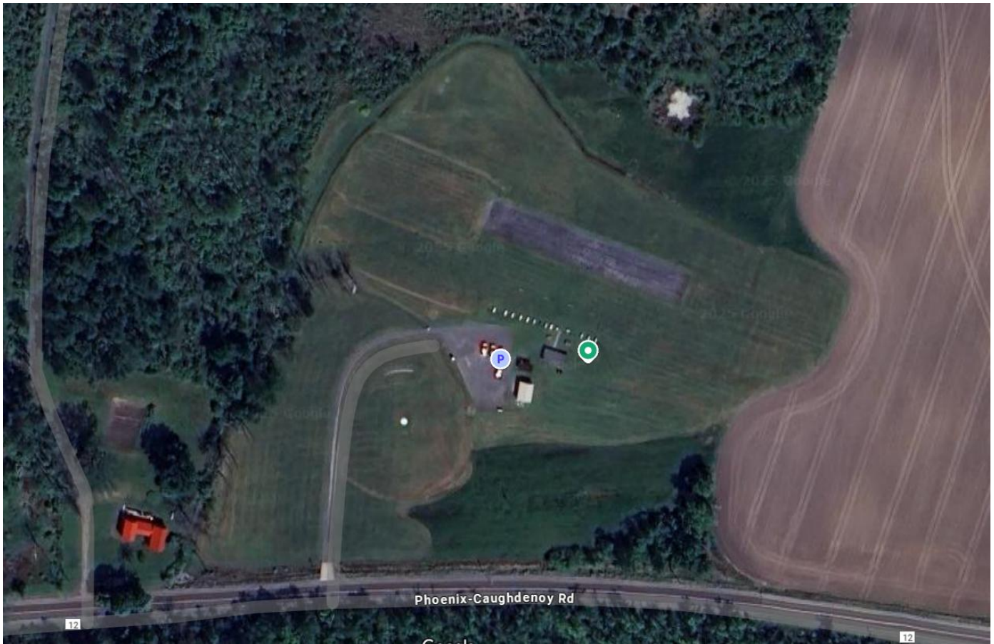
The latest satellite photo